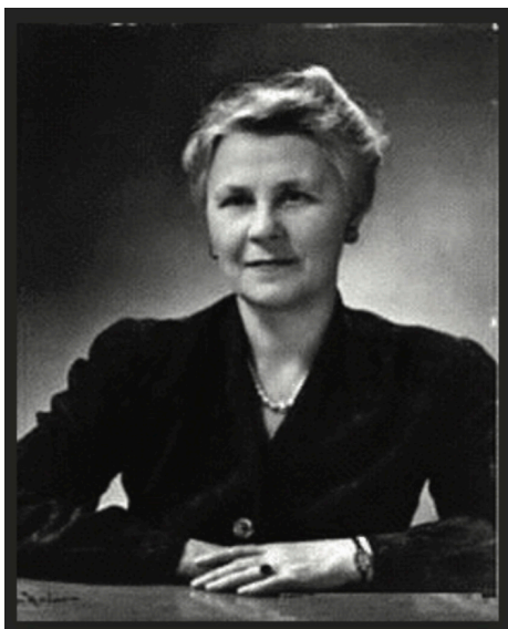
Lois B. Wilson March 4, 1891–October 5, 1988