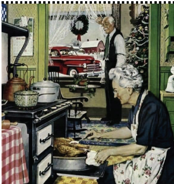
Keep it Simple